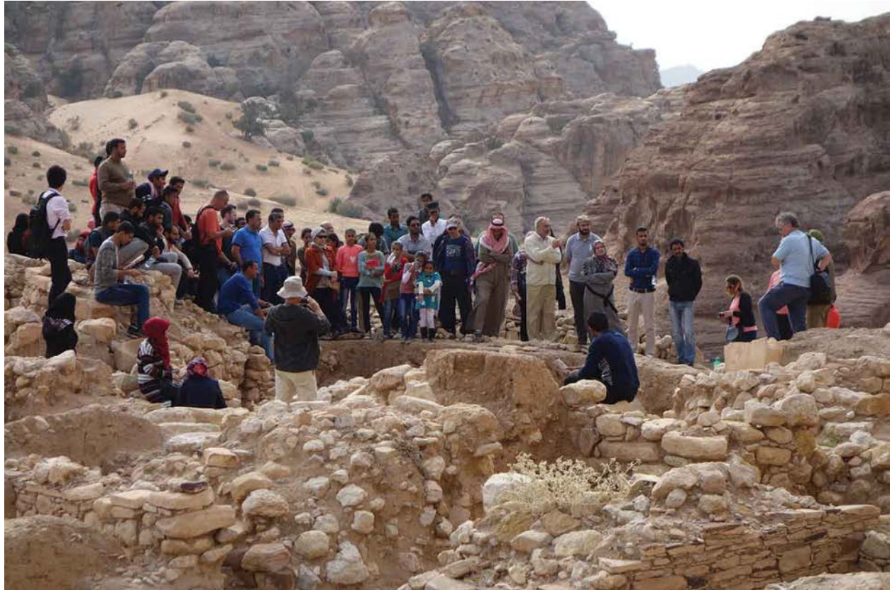
[Figure 2: Tour with Local Community at Neolithic Site of Beidha]

interpretative signboards along the path and at the site itself. Shortly after Petra was declared a World Heritage Site in 1987, members of the Amareen tribe who lived in Siq El Bared were moved to a new purpose-built village 2km from the site, while others continued to use the 1940s stone and mud buildings of the kherbeh and occupy the area in tents, many close to the Neolithic site itself.