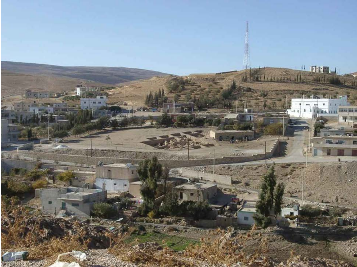
[Figure 3: The Neolithic Site of Basta]

DEEPSAL aimed to examine how these Neolithic sites currently contribute to local communities, to analyze how different factors affect the contribution of this heritage and assess how cultural heritage can be mobilized in the future to benefit the communities. Specifically, this includes the project aims to: